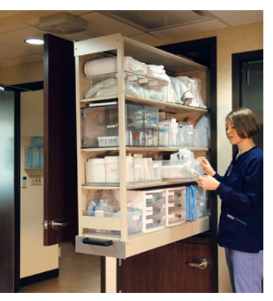
CORESTOR® PATIENT SERVER SYSTEM Restock medical supplies in the hallway, then conveniently access them inside the room when needed for the patient.