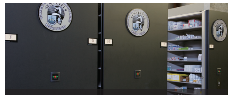
HIGH-DENSITY MOBILE STORAGE SYSTEMS (HDMS) Spacesaver's HDMS double your storage capacity, and let you keep more patient files, bulk pharmaceuticals, surgical equipment and other supplies right on site and readily accessible.