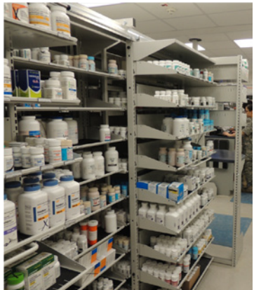
FRAMEWRX® HD Compresses two rows of storage into one deeper space, thereby "saving and aisle." When space is at a premium, this is a lasting advantage.